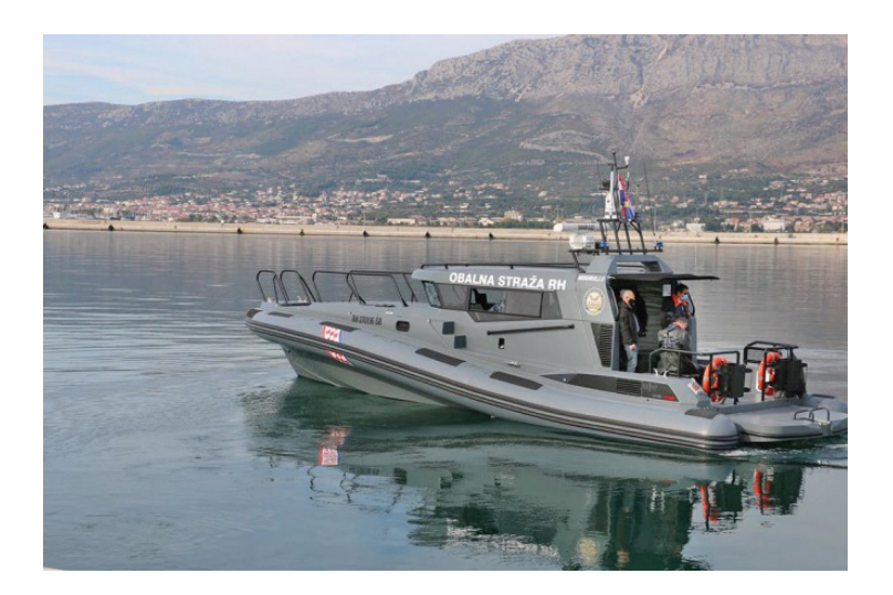
Figure 1. Fast inflatable boat VHB-46 in the Coast Guard of the Republic of Croatia (Mišić, 2020)

When comparing the development of leaders in the military and civilian sectors, it can be seen that military officers spend at least twice as much time in classrooms and training activities than their civilian equivalents. According to the Ulmer Jr. (2005), one of the important different background characteristics between the U.S. Army brigadier generals and their corporate counterparts (managers) is that 95 per cent of the generals have a master's degree or higher, while only about 35 per cent of the company leaders have attained that level of formal education. By positioning research of the team leadership in domain of the military organization, we firstly focused on the Croatian Navy, as the bearer of protecting interests of the Republic of Croatia on the Adriatic Sea. At the same time, we also single out the Coast Guard of the Republic of Croatia (illustration in Figure 1), a unit within the Croatian Navy.